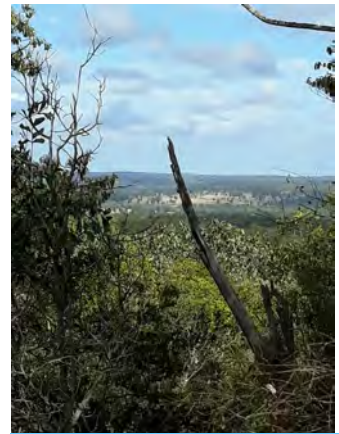
The view from a high point within Reinke Scrub Conservation Park looking towards "Old Proston". 25 people enjoyed the last walk held in June. The next walk is planned for September and all are welcome to join in. More details next newsletter.

* Great to see travellers regularly using the Overnight Camp area. The Proston Scout group also gathered around the firepit in this area for a fun family night of singing songs and performing funny skits to celebrate the end of Term 2.