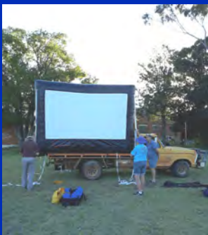
Setting up the big screen for the Movies in the Park.

Another (hopefully warmer) movie night is planned for September so watch this space!