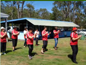
Tai Chi Demonstration