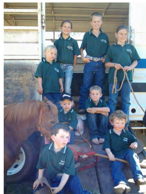
Our Pony Clubbers are looking a little tired at the end of a fun morning out with their ponies and friends.

Lions are also seeking used stamps to assist in purchasing walking aids for children born with cerebral palsy.