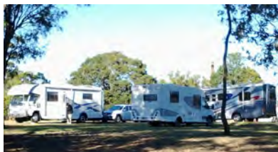
Some happy travellers enjoy our Overnight Campground