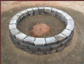
"Fire the Brand" Campfire Evening will record local families brand history

I would like to congratulate all of our wonderful Lions Clubs on the 100th Anniversary of Lions International this year. I am a proud Proston Lion although I don't ever get enough time to participate in the meetings and activities that I would like to.