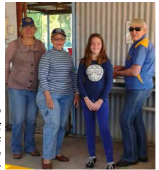
Lions Club members keeping the burgers coming at the Hivesville Market

Markets and running the bar at the annual Boondooma Dam fishing competition. Thank you especially to the Proston Lions for volunteering to run the annual Christmas Carnival again this year. Hats off to our Lions Club and Happy Anniversary!!