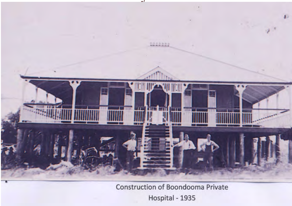
Construction of Boondooma Private Hospital - 1935

The hospital operated until 1940. After its closure the building became the Margaret Marr Boys Home during the war years. The verandahs were closed in and used as dormitories for the boys and underneath the building was also closed in and was used as a kitchen-dining room. Following the end of the war, the building became a boarding/guest house. It is now a private residence and is situated opposite the Anglican Church in Proston.